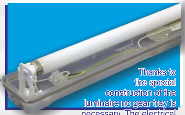
necessary. The electrical components are mounted directly into the housing in order of cost optimisation. This luminaire represents the cheapest solution for your waterproof lighting with that.